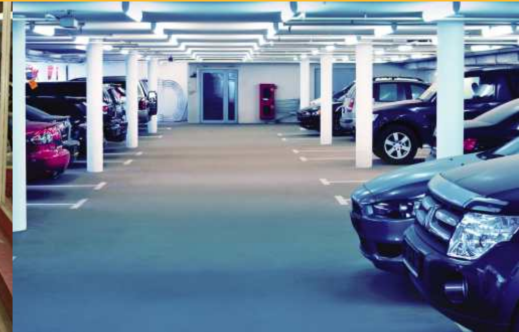
2 LEVEL BASEMENT PARKING