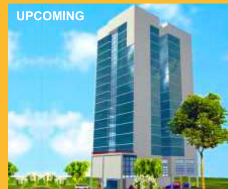
Baba Vistas, Okhla, Phase 1

Express Trade Towers 3, Sector 34, Hero Honda Crossing, NH-8, Expressway, Gurgaon