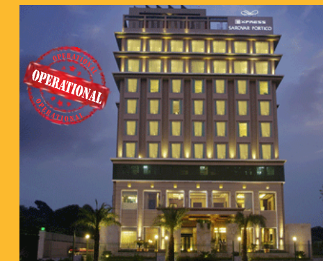
Express Sarovar Portico, Surajkund