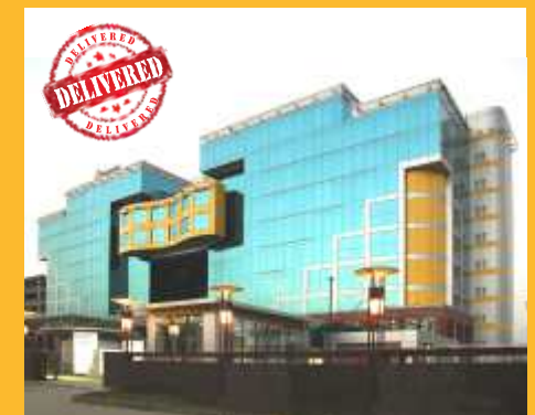
Express Trade Towers 1, Filmcity, Sec.16A, Noida